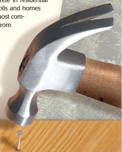
Source: Consortium for Research on Renewable Industrial Materials *Global Warming Potential

"Wood and Green Building" is a series of fact sheets produced by the Wood Promotion Network for the industry and its customers. Copies are available online at www.beconstructive.com .